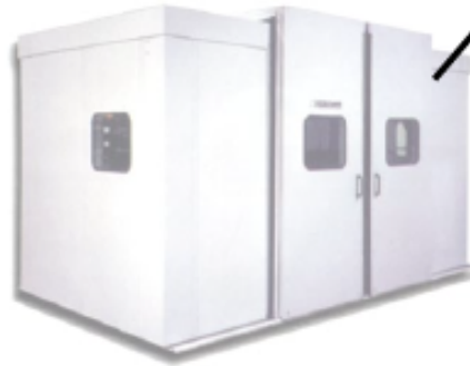
Quick Removable Panels