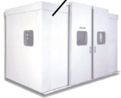
Modular Acoustical Panels